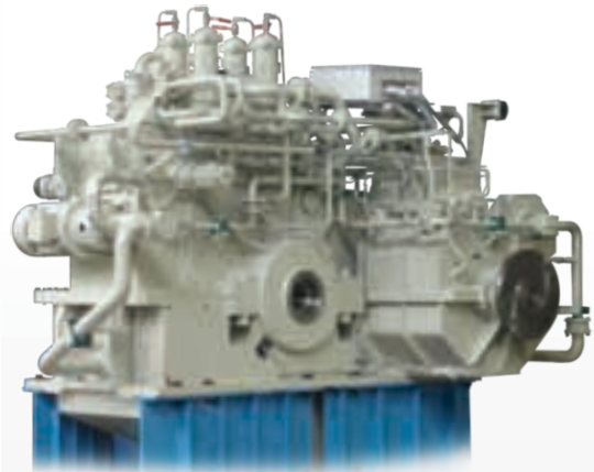
Marine reduction gear for CPP Drive Type ASL 103 Power rating : 9,000 Kw for Coast Guard OPVs