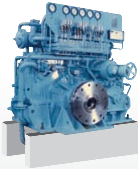
Marine reduction gear for CPP Drive Type ASL 69 Power rating : 4,700 Kw for Coast Guard OPVs