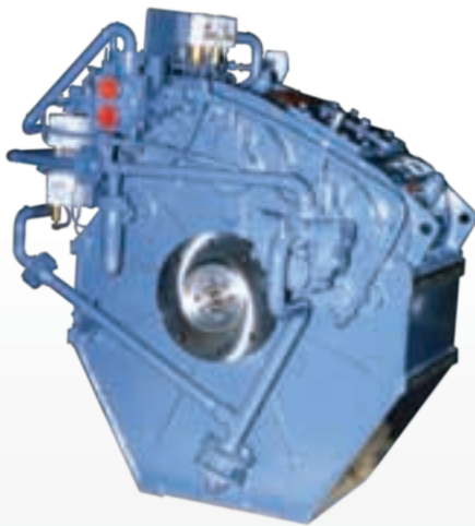
Marine reduction gear for Fixed Pitch Propellers Type AWS 40 Power rating -340 Kw